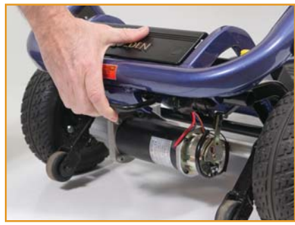
To separate the rear transaxle from the frame, squeeze the release lever located on the underside of the frame