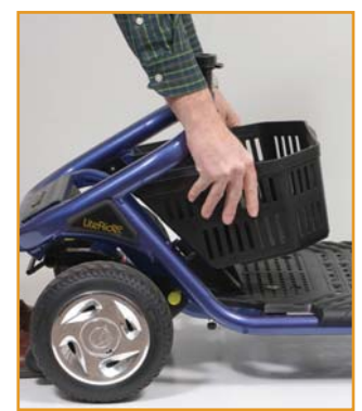
Remove the baskets from under the seat and from the tiller (not shown)